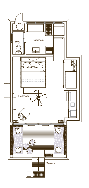
13 VILLAS – (47 m<sup>2</sup>) North Beach – Villa (air conditioned)

12 VILLAS – (47 m<sup>2</sup>) South Beach – Villa (air conditioned)